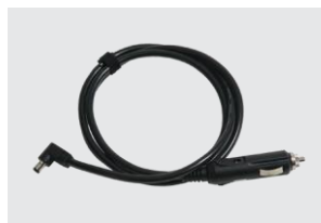
DC POWER CORD