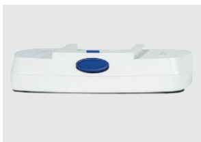
8-CELL BATTERY PACK