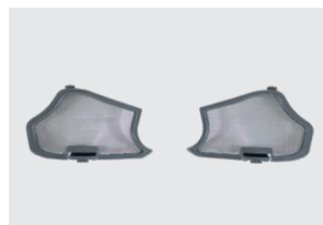
EXTERNAL GROSS PARTICLE FILTERS