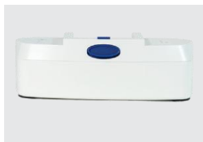
16-CELL BATTERY PACK