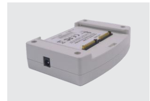
DESKTOP BATTERY PACK CHARGER (OPTIONAL)