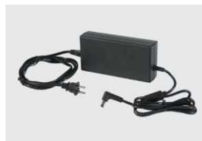
AC POWER SUPPLY (ALL CORDS INCLUDED)